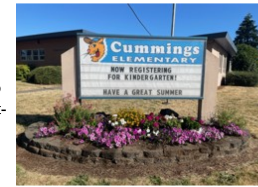
Flower Beautification Project by WKNA